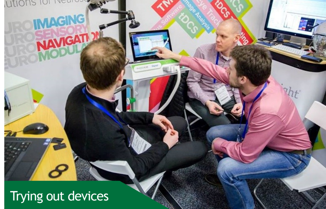
Trying out devices