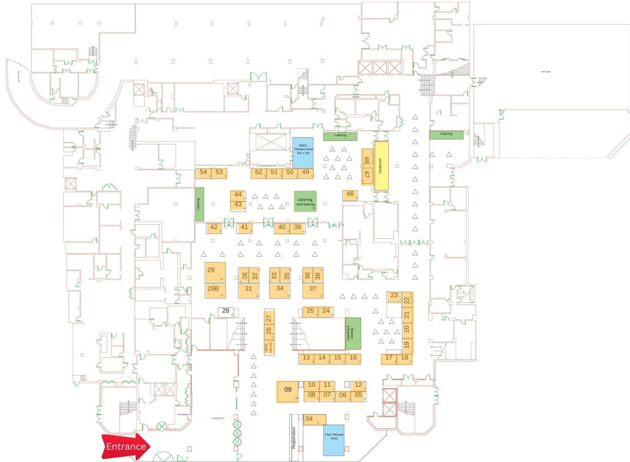
As existing ground floor plan 1:200